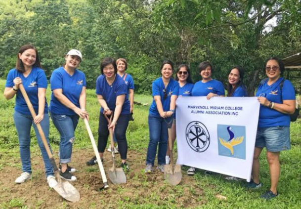
Photo shows the current Board during the groundbreaking of their project at the Laiban community.

Interested alumni are asked to submit a signed Letter of Intent to serve the Board, two (2) copies of his/her updated resume and two (2) recent full-color pictures to the MMCAA Office, Rm. 112 Ground Floor, Caritas Hall, Miriam College, Katipunan Avenue, Loyola Heights, Quezon City, Metro Manila 1108, or via email to alumni@mc.edu.ph. All requirements should be submitted not later than 11:59 p.m. of Saturday, July 12, 2019.