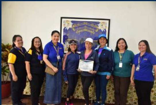
MCHS '78 donates new Sound System to the MC HEU Chapel and vessels and vestments for mass