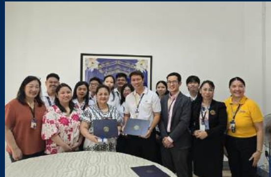
MCHS '78 donates to the Associate in Digital Design Technologies program