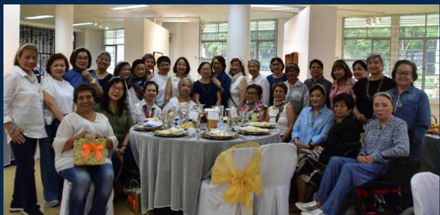
Maryknoll College Class of 1971 Reunion: "Nostalgic Visit"