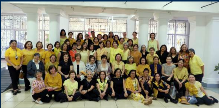
Golden Jubilarians Maryknoll College Class of 1974