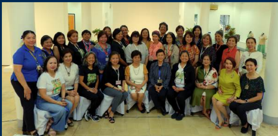
Golden Jubilarians Maryknoll College High School Class of 1974